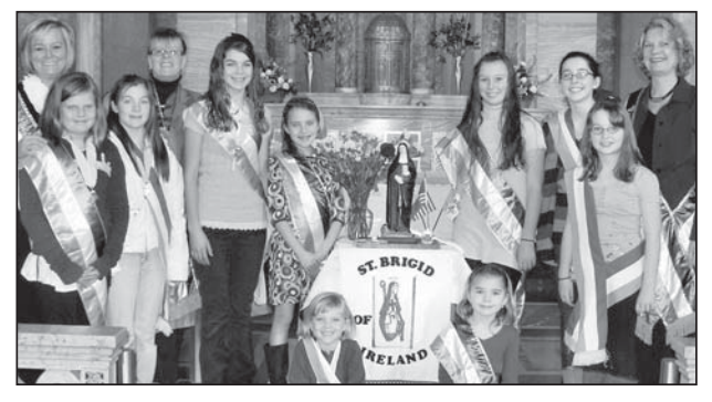
The Junior Girls at St. Brigid's Mass celbrated at the Convent of St. loseph Academy, Brentwood, NY.